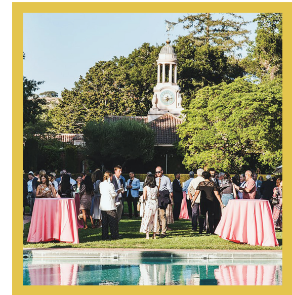
▲ Annual Gala featuring CSMA alumnus Taylor Eigsti held at Filoli