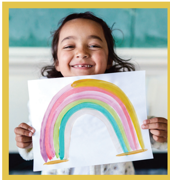
▲ $400,000 in financial aid provided to students and schools