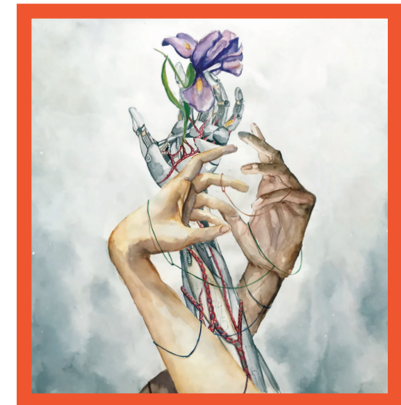
▲ World premiere of commissioned work "Imagine Our Future" by Taylor Eigsti