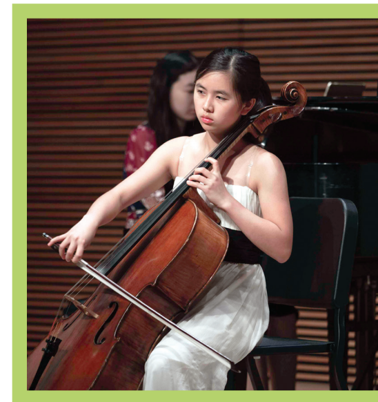
▲ 16 free Community Concerts presented in Tateuchi Hall