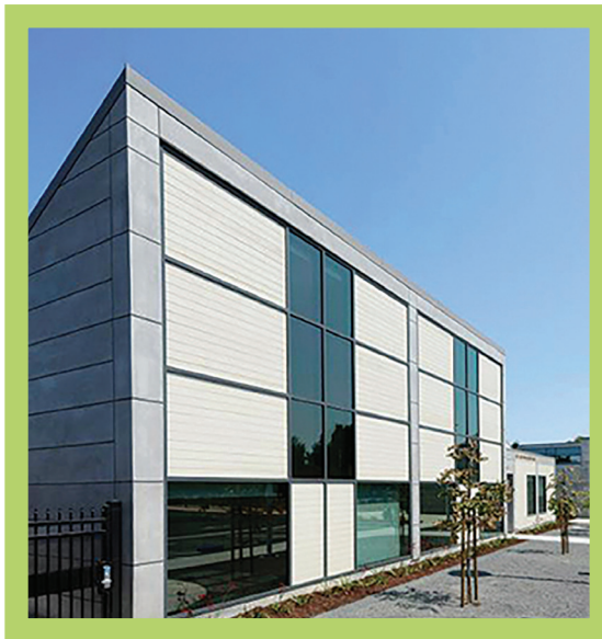
▲ New Roy and Ruth Rogers Wing completed