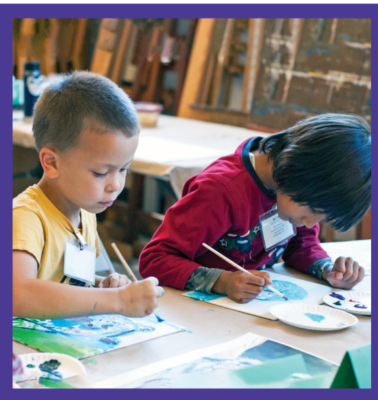
▲ Art students returned to campus at pre-COVID level of enrollment