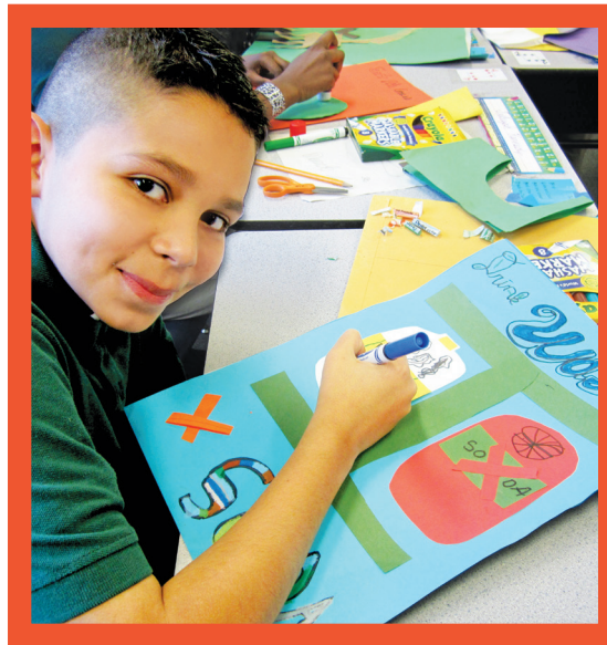
▲ In-School Program served 50+ schools