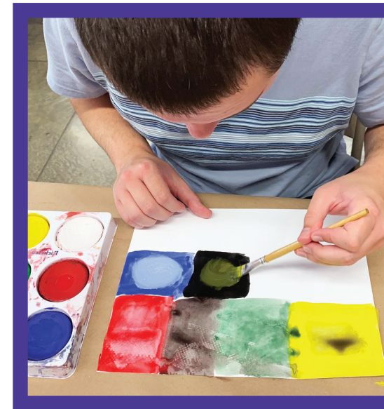
▲ Artistic Intelligence program offered in-person and online