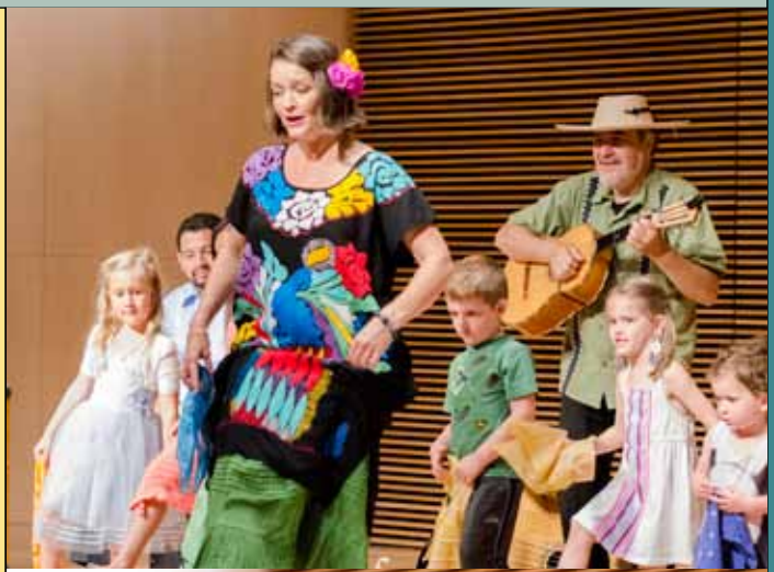
Cascada de Flores