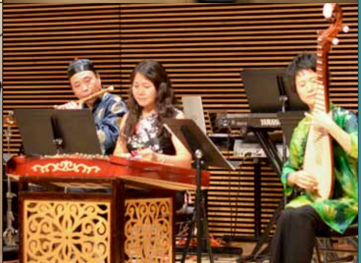
Melody of China